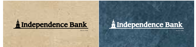
On light background

The Independence Bank logo should have a strong contrast on any textured background.